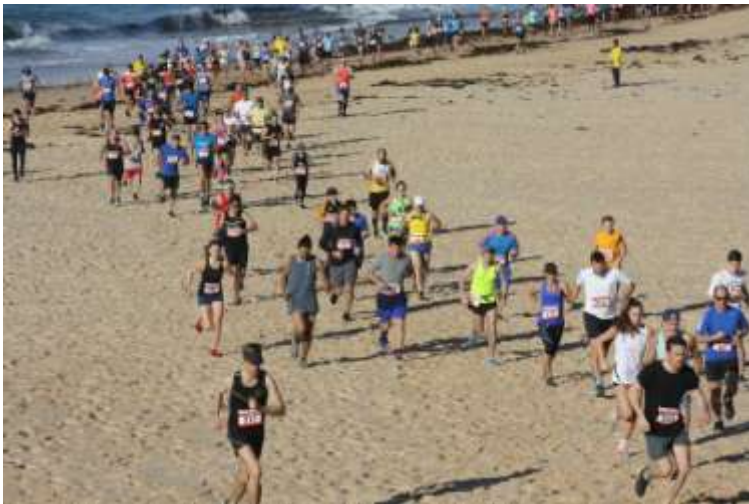
A heavy run up the beach