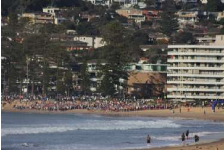
The crowds at the start of the race