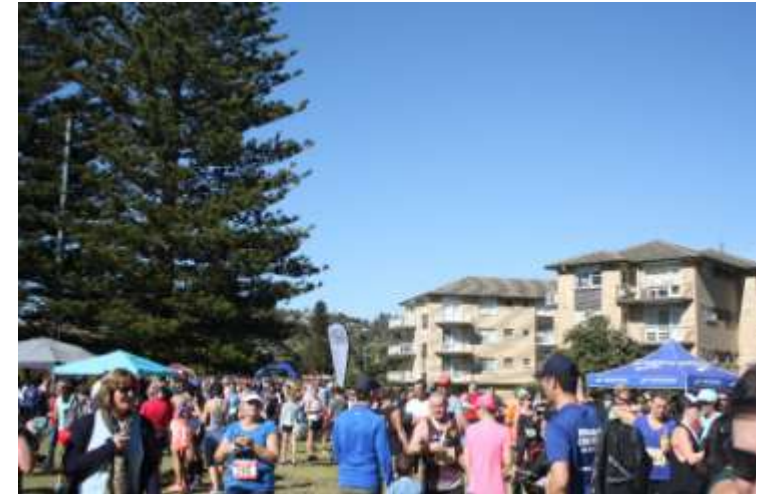
Every one enjoying the after party at Newport