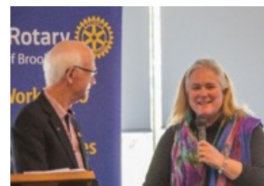
RYLARIAN from some years earlier