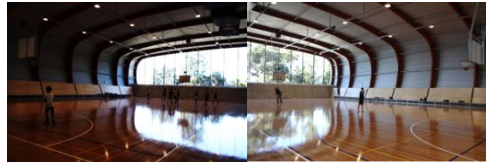
The two sides of the main courts. Will suit Basket Ball, Net Ball, Foot Ball

“DO IT ONCE - DO TI WELL” Visit to PCYC Dee Why