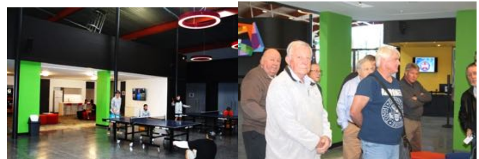
Common area, Computer, Ping Pong- We are having the facilities explained