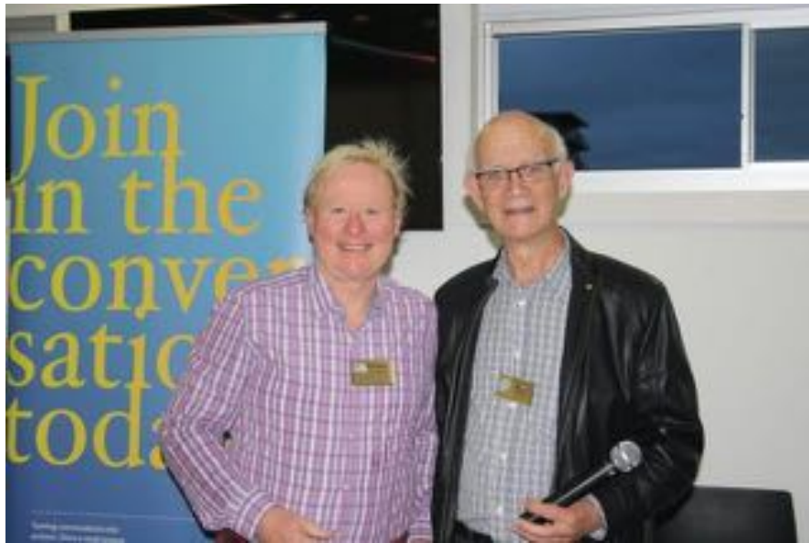
At our 2018 Pub2Pub Presentation Night 24/10/2018