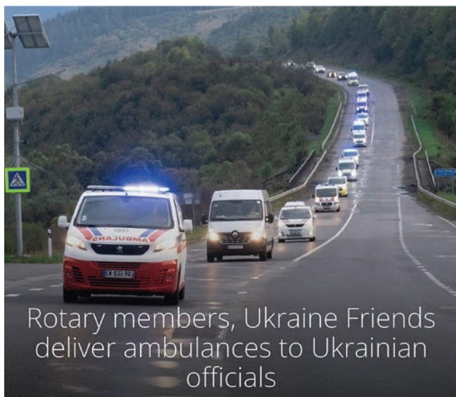
Rotary members, Ukraine Friends deliver ambulances to Ukrainian officials