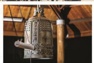
Australian World Peace Bell