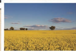
Vast fields of canola

District 9685 Annual Conference 17-19 March 2023