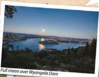
Full moon over Wyangala Dam