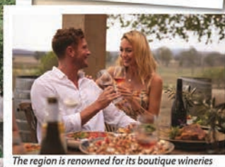
The region is renowned for its boutique wineries